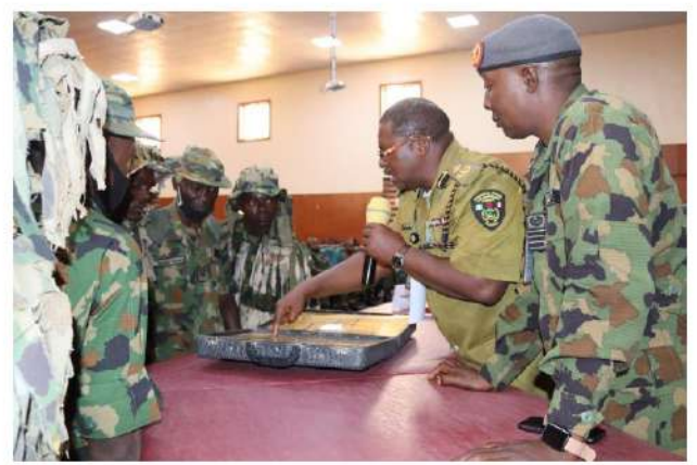
Figure 2: Images showcasing the “Question & Answer” session at the sensitization programme