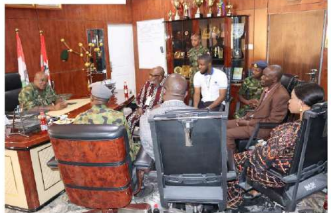
Figure 4: Images of the facilitators' meeting with the Commandant of the Nigerian Army School of Infantry (NASI)