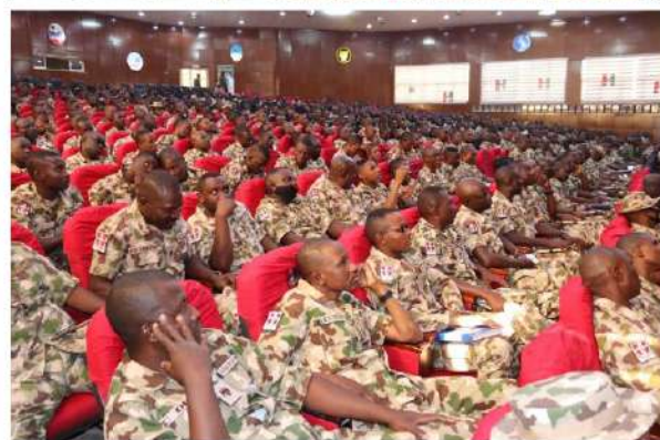
Figure 1: Images of members of the Nigerian Military during the Sensitization programme