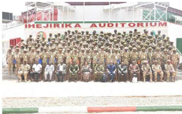
Figure 5: Images of the facilitators and members of the Nigerian Military at the end of the sensitization programme