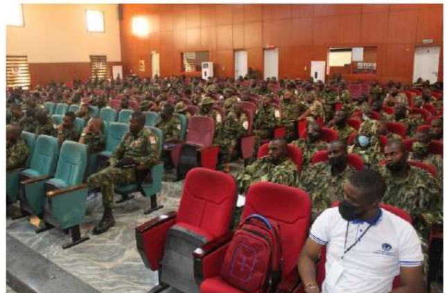
Figure 3: Images of participants during the sensitization programme